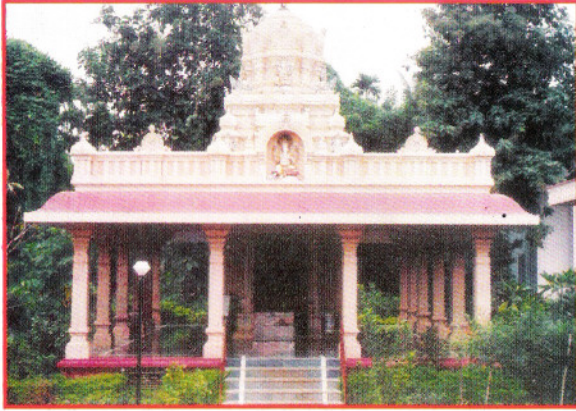
Sri Mahaganapati / श्री महागणपती