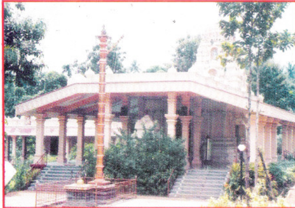
Sri Balaji / श्री बालाजी

॥ Om Namo Venkateshwaraya ॥ ॥ Om Sri Mahaganapataye Namaha ॥