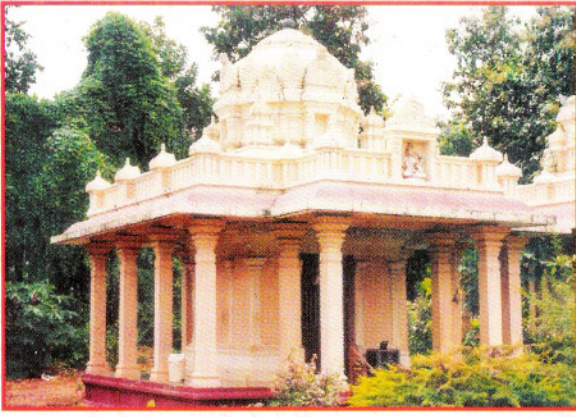
Sri Padmavati / श्री पद्मावती