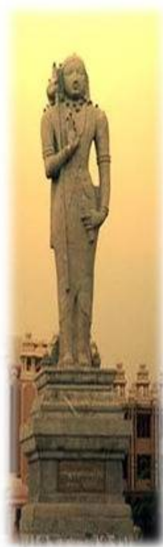
120-Foot Adi Shankara Vighraha at Kanchi