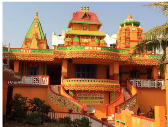
Shankara Math at Puri