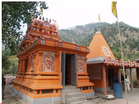
Saraswati Mandir, Rambhan, Jammu-Kashmir