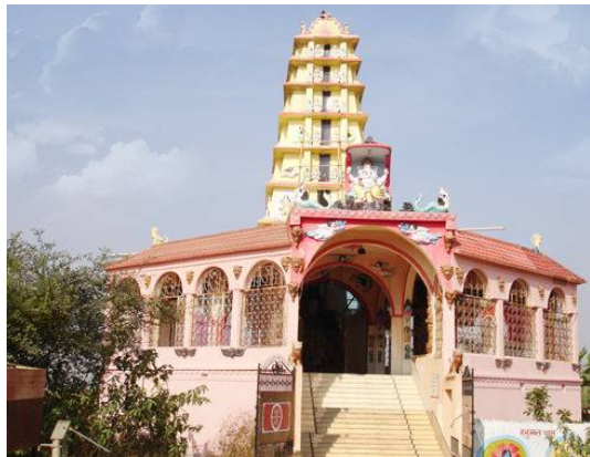
Hanuman Mandir, Ranchi