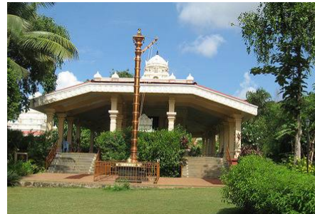
Balaji Mandir, Goa