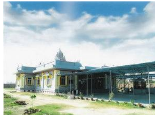
Shankara Mandir, Noida