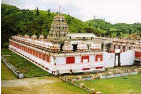
Ekavan Shaktipeeth, Ambaji, Gujarat