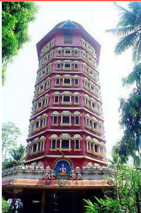
Keerti Sthambam - Kalady