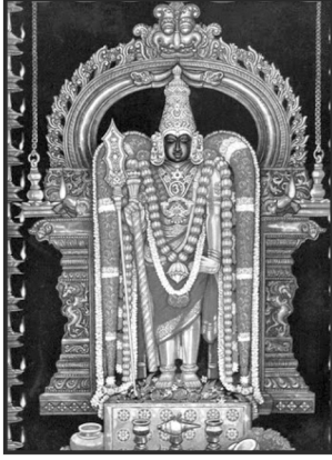
Sri Gurubhyo Namaha Sri Swaminatha Swamine Namaha